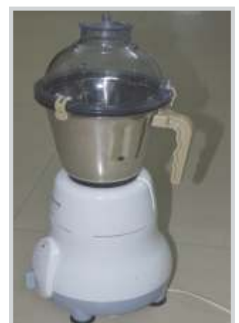
Grinding into fine powder using a blender

To detect 0.25% Roundup Ready corn at 95 % confidence, it is necessary to have 3 sub samples of 400 corn seeds each and all three sub samples should test negative. Weight of 400 corn seeds is 100 gm.