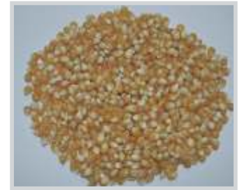
Bulk grain corn

The total incubation time of the assay is 10 minutes.