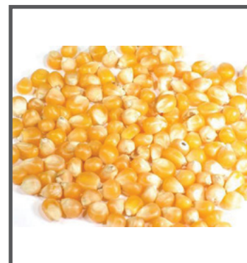
Bulk grain Corn

The total incubation time of the assay is 10 minutes.