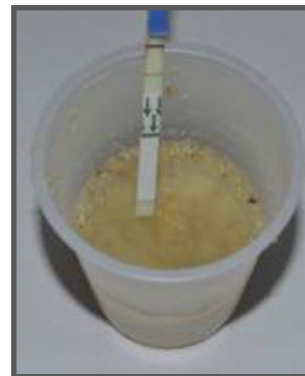
Strip with positive result in bulk grain extract