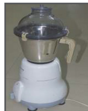
grinding into fine powder using a blender

The kit should be stored at 2 - 8° C. The unopened kit is stable till the expiry date printed on the kit label. The cap of the canister should be closed firmly after removing the required strips. Exposure to moisture is likely to affect the performance of the test strips.