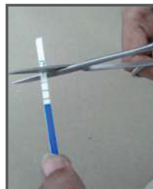
Cutting of strip for permanent record and storage