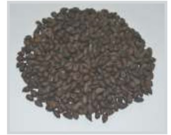
Bulk Cotton Seeds

The total incubation time of the assay is 10 minutes.