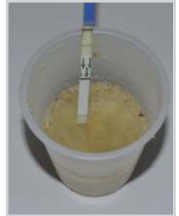
Strip with positive result in bulk grain extract