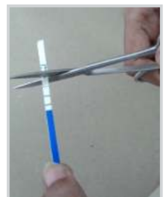
Cutting of strip for permanent record and storage

The appearance of faint test line after 10 minutes should not be necessarily interpreted as positive test.