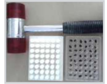
Hammer, crusher and crushing plate

Crushed seeds should be tested on the same day.