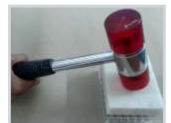
Hammering to crush the seeds