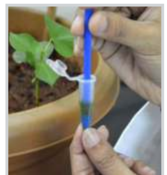
Extracting protein by crushing with pestle

Crushed seeds should be tested on the same day.