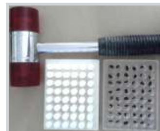
Hammer, crusher and crushing plate

The total incubation time of the test is 10 minutes.