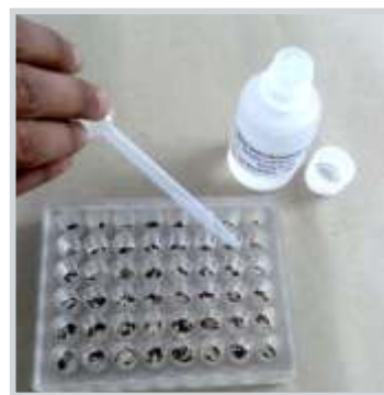
Adding extraction buffer