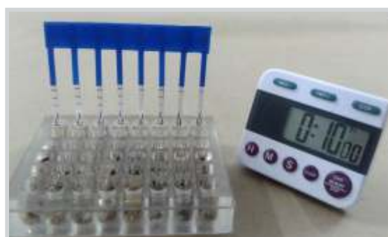
8-strip comb in 48 well plate