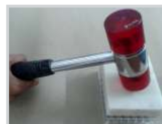
Hammering to crush the seeds

Use 48 well seed crushing plate, seed crusher and hammer to crush 48 seeds at a time. Add 1.0 ml of extraction buffer using calibrated dropper. Mix well and wait for 10 minutes.