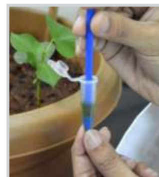
Extracting protein by crushing with pestle

Crushed seeds should be tested on the same day.