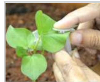
Punching a leaf in microfuge vial

The total incubation time of the test is 10 minutes.