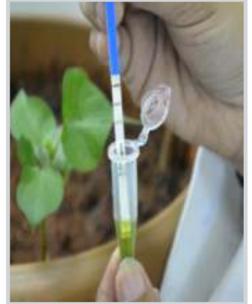
Strip in leaf extract with positive results