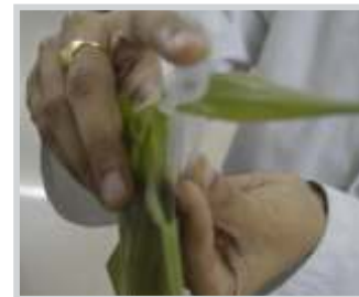
Punching a Corn leaf in a microfuge vial

Cry1Ab lateral flow strips (LFS) test kit is intended to be used for the qualitative detection of Cry1Ab protein in individual corn leaf or seed samples. The kit detects Syngenta event Bt 11 and Monsanto event Mon 810. The total incubation time of the assay is 5 minutes.