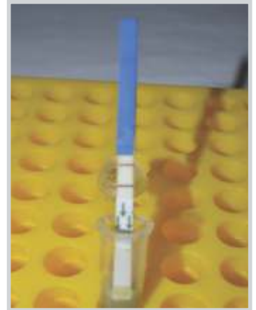
Strip in leaf extract with positive results