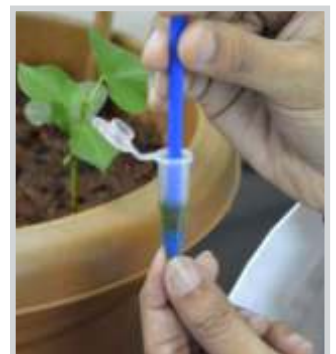
Extracting protein by crushing with pestle

Crushed seeds should be tested on the same day.