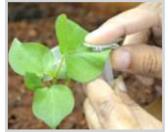
Punching a leaf in microfuge vial

The total incubation time of the assay is 5 minutes.