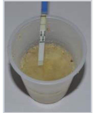
Strip with positive result in bulk grain extract