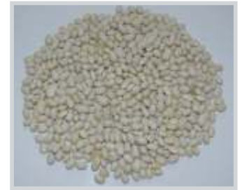
Bulk Soy bean grain

To detect 0.1% Roundup Ready soybeans at 95 % confidence, it is necessary to have 3 sub samples of 1000 beans each and all three sub samples should test negative. Weight of 1000 beans is 150 gm.