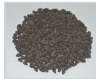
Bulk Cotton Seeds

When the LFS is placed in the sample extract, the CP4EPSPS protein present in the sample extracts binds to the antibody labelled with gold and the complex moves upward by capillary action. The complex then binds to the antibody coated on the test line resulting in pink/purple color test line. As the complex moves further up, it binds to the control line resulting in pink/purple color control line. In absence of CP4EPSPS, the test line does not appear as no complex binds to the test line while control line turns pink/purple color indicating validity of test protocol.