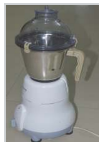
Grinding into fine powder using a blender

To detect 0.1% Roundup Ready cotton seeds at 95 % confidence, it is necessary to have 3 sub samples of 1000 cotton seeds each and all three sub samples should test negative. Weight of 1000 cotton seeds is 100 gm.