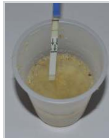
Strip with positive result in bulk grain extract