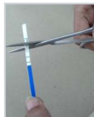
Cutting of strip for permanent record and storage

The appearance of faint test line after 10 minutes should not be necessarily interpreted as positive test.